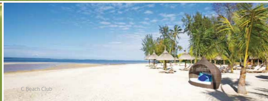
C Beach Club