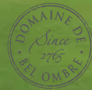
Heritage Golf Club, Domaine de Bel Ombre