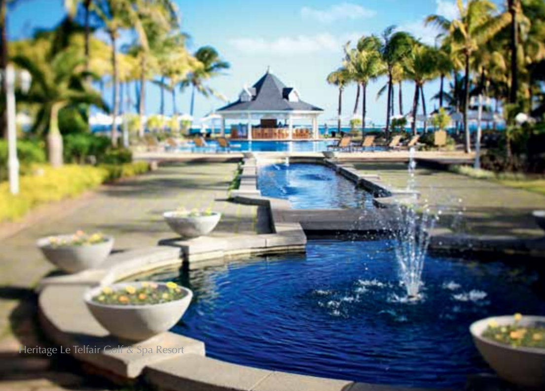
Heritage Le Telfair Golf & Spa Resort