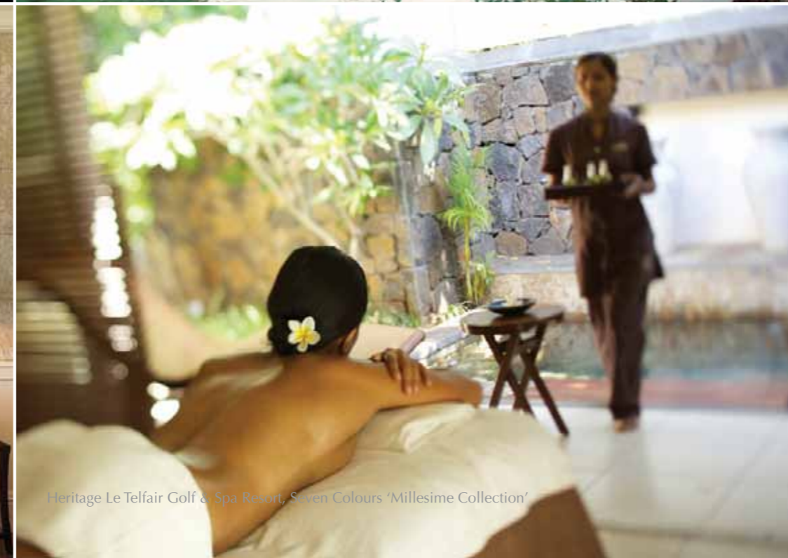
Heritage Le Telfair Golf & Spa Resort, Seven Colours 'Millesime Collection'