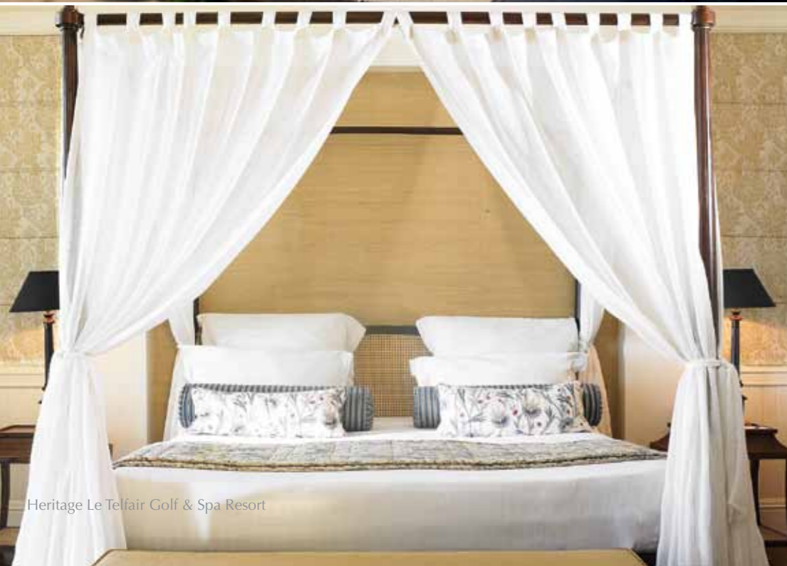
Heritage Le Telfair Golf & Spa Resort