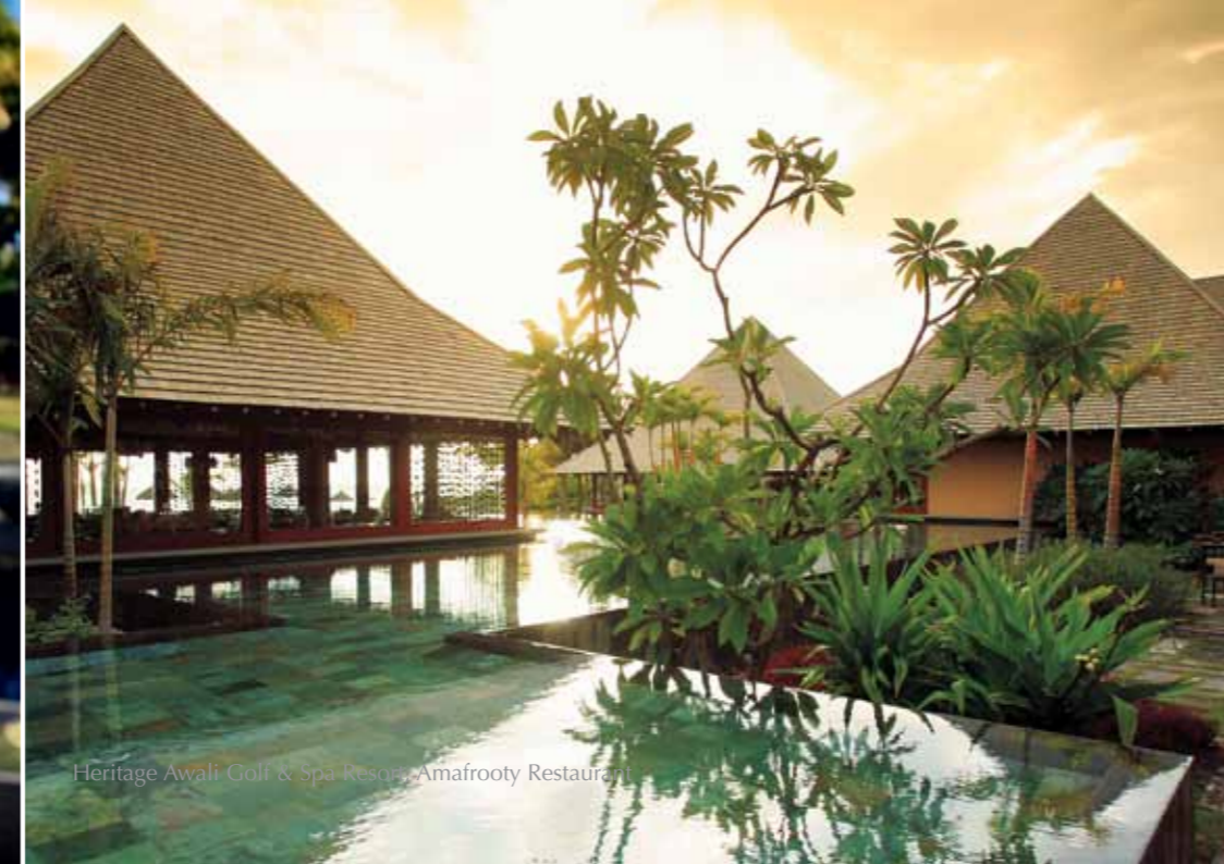
Heritage Awali Golf & Spa Resort, Amafrooty Restaurant